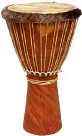
Djembe – the lead drum

With its remarkably flexible range of tones, produced by its thin goat skin, shape and tight tuning, the Djembe is West Africa's most popular drum. Used throughout West Africa today, it is traditionally from Senegal, Guinea, Burkina Faso and the Ivory Coast amongst the Bambara, Mandingo and Malinka tribes. The bass is played with an open hand in the centre of the drum producing a deep and resonant note. The tone is played on the side of the skin with a firm hand, producing a high pitched note. The slap is played by an open hand pivoted on the side of the drum, throwing the fingers forward to slap the skin. This produces a crisp, sharp note, which can cut through the loudest music. The Doun Doun is a double - ended bass drum made with thick cow skin. Often the hair is left on the skin producing a warmer, and more mellow tone. It is the most commonly played as the bass for the Djembe, usually in a pair of different sizes. The Donno is held under one arm, and squeezed to tighten the heads and produce a variety of pitches. This imitates the speech patterns of African languages, and explains why it is often known as a " talking drum."