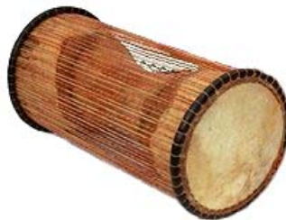
Donno , or Talking drum